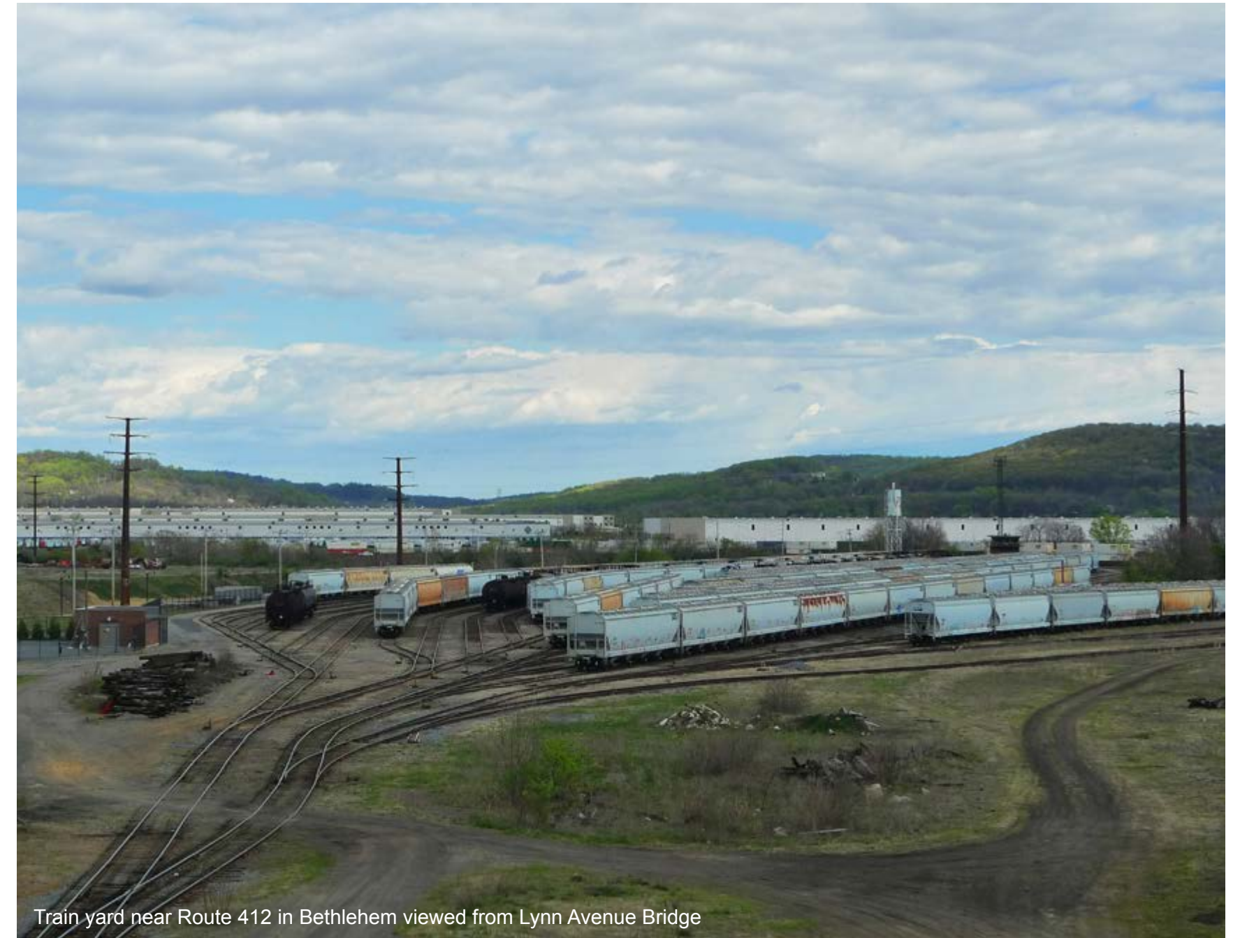
Train yard near Route 412 in Bethlehem viewed from Lynn Avenue Bridge